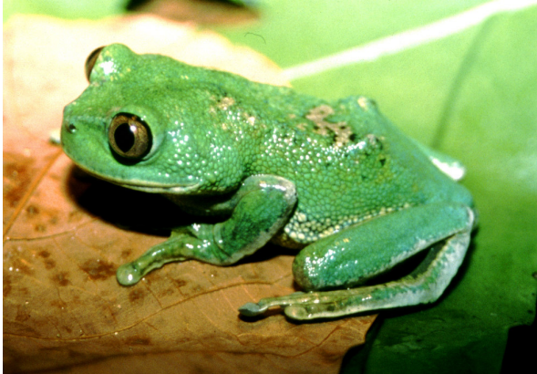
FIG. 1. Female holotype of Leptopelis crystallinoron in life (ZFMK 73139). Note absence of tympanum.

Adult female in non-reproductive state; body robust (Fig. 1), head narrower than body and head width; snout appears truncate in dorsal view (Fig. 2b), and rounded in lateral view (Fig. 2a); maxillary and vomerine teeth present, the latter massive and fused to U-shaped structure (Fig. 2e); choanae rounded; tongue as long as wide, free for about half its length; nares lateral, visible from dorsal view (Fig. 2a,b); canthus rostralis straight; loreal region slightly concave; eye relatively large with horizontal eye diameter almost twice the distance from